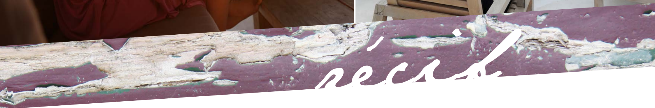
from left to right: cocktail at sundowner, cosy corner